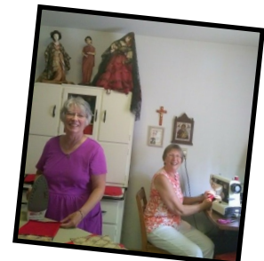
Ellsworth chapter Right to Life members making masks for our Patron mailing.