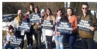
Winter 2020: 40 Days for Life participants at Maine Family Planning in Augusta.