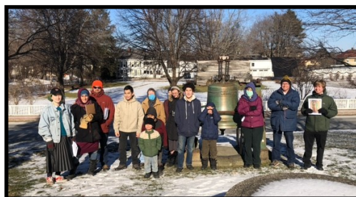
Independent group of community members observing the 48th Memorial of Roe v. Wade at our Capitol in Augusta.