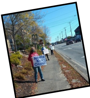
2020 Life Chain event Ellsworth, ME